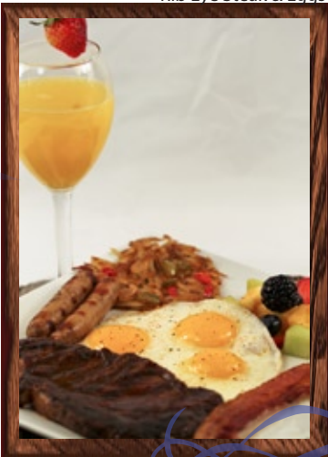
Rib Eye Steak & Eggs