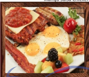
Mango Salsa Chicken