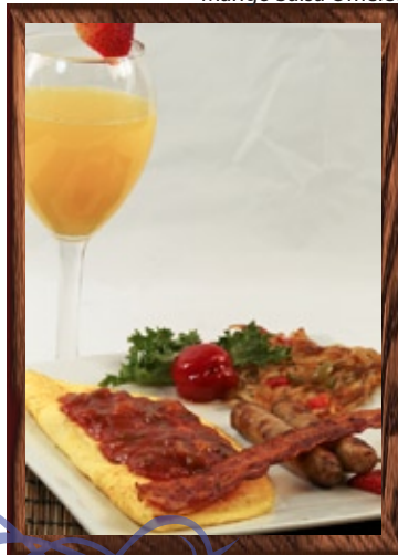
Mango Salsa Omelet